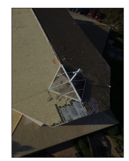
Full View of Church Roof

Thankfully, the seas receded rather than encroached. We were without power for two weeks, but we were blessed with a Parish Family that would not be broken. Instead, we rose to help those around us with food, clothing, water, ice, and diapers, becoming one of the main distribution points for North Naples, even distributing meals to Naples Park Elementary families three weeks after the storm.