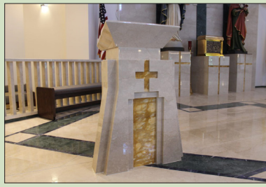
New Ambo is Made to Proclaim the Word of God to the Entire Church

So, what does all this tremendous effort mean for our Parish Family? We now have a completely transformed campus that will serve us all for decades to come. In hard "dollars and cents:"