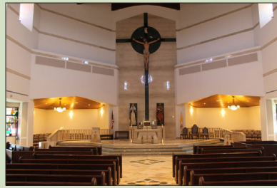
The Full Grandeur of Our Sanctuary

Last but certainly not least is our new church. Every inch has been updated and repaired. There are parts that you may never realize have been completely renovated, like the plumbing and electrical work. You may have already felt the Air Conditioning is tremendously improved as all duct work was replaced with the proper materials. Then, of course, there is all the visible effort, like the beautiful Liturgical environment, including new pews and marble from Florence, Italy. We ensured that the church building would be efficient and joyous for the next 30 years of Saint John's service to our community and Parish Family, including "future-proofing" the building (for example, those platforms on the side of the walls are for potential projectors to view the Psalms and other Mass parts, if we determine that our Parish Family would like that type of engagement).