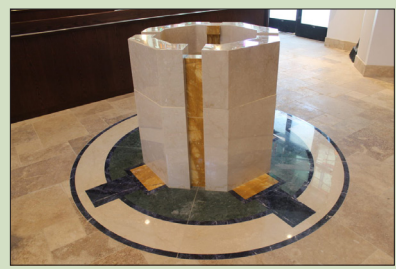
New Permanent Baptismal Font