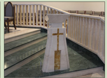
New Lecturn for the Cantor is Now off the Altar