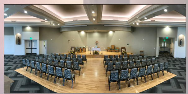
New Ballroom was Our Church