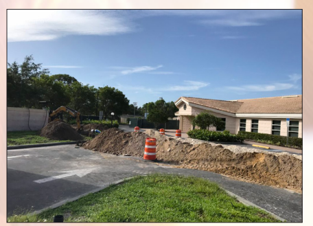
A Trench Had to Be Dug for AC Units to the Claussen Center