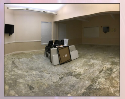
Flooding in Claussen Center Lost All Flooring

Our smallest building on campus has one of our most important missions, the Catholic education of our Parish Family and the local area. Both the Youth and Adult Faith Formation programs emanate from this building, as well as our on-site counseling services and our brand new Library (featuring both paper and electronic media and study space). This building sustained flood damage from Irma, so the walls would need to be opened up and the floors replaced. Additionally, the air conditioners for the building had totally failed, requiring not just a replacement, but a total overhaul, including new pipes from the outside units.