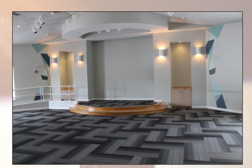
New Flooring and Painting for our Alexandria Room (Formerly the Seminar Room)