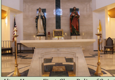
Altar Houses First-Class Relic of Saint Thomas the Apostle