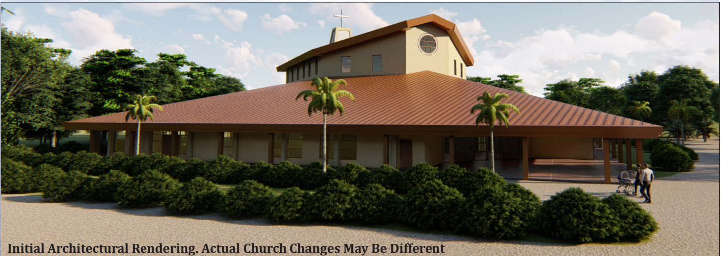
Initial Architectural Rendering. Actual Church Changes May Be Different