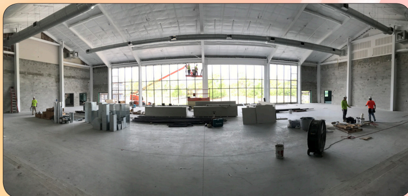
A view from the stage of the Pulte Family Life Center, which will house unique programs and activities to invigorate our Parish Family and the entire community.

http://w2.vatican.va/content/francesco/en/homilies/2018/documents/papa-francesco_20180520_omelia-pentecoste.html