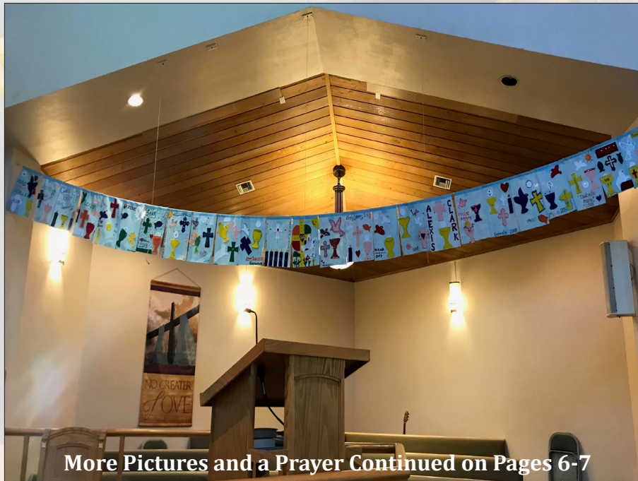
More Pictures and a Prayer Continued on Pages 6-7

Each of our First Communicants and their families individually designed and constructed these banners as an expression of the youth's identity as a child of God, utilizing Catholic symbols like the cross, chalice, or a dove, that are meaningful to the youth. Sacraments are a communal celebration, and we hope that these banners will renew and spark the faith of all the families of the first communicants, as well as the members of our Parish Family, partaking in the Eucharist at Mass. As you reflect on these banners, please say a prayer for these youth and their families so you can accompany them on their faith journey.