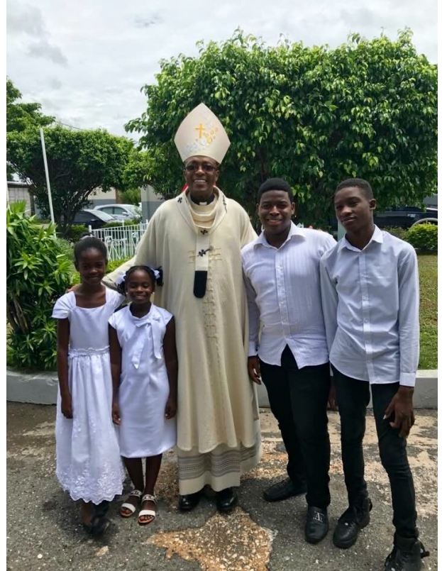
Archbishop Richards with students

We are indeed grateful and thankful to all of you for your past, present and future support.