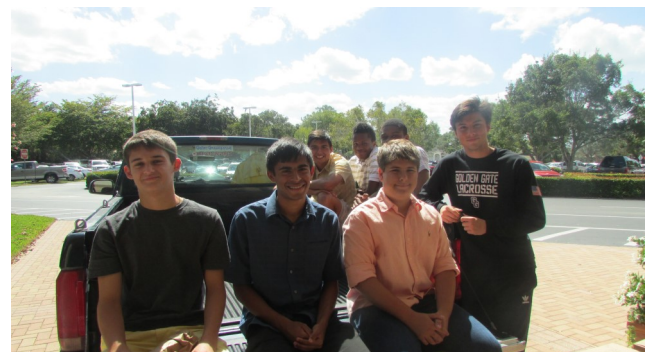
Students Helping with the Food