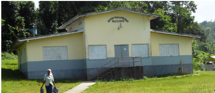
Sacred Heart Clinic