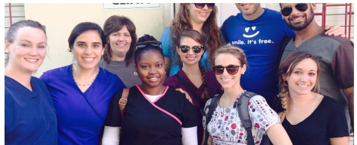
Nov. 2016 Mission Trip

The Catholic Church has established a presence there since 1834 and there is a wonderful little church, clinic, basic school and primary school located at the site. There are about 1500 residents in the immediate area and about 300 of them are members of the Sacred Heart family.