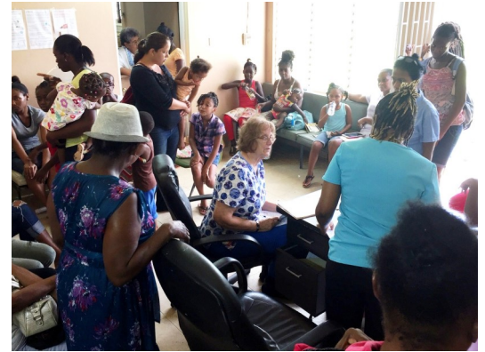
July Mission Trip

There is an on-going need for funds to keep the pharmacy stocked and for missionaries in the dental/optical and medical field to staff these missions.