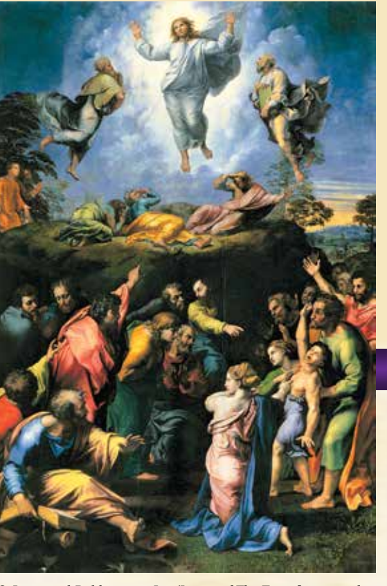
© Liturgical Publications Inc./Image of The Transfiguration by Raphael © 2007 by Dover Publications, Inc.

For heaven's light and glory is beautiful to behold Elijah and Moses' story is for heaven told A journey with the teacher exciting and bold