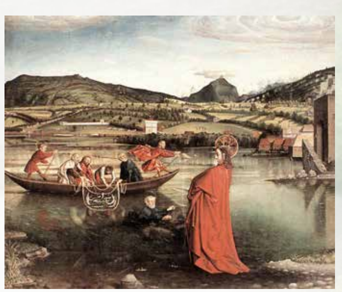
"The Miraculous Draught of Fishes" by Konrad Witz

A journey begins with hopeful end Fishers of men to God do bend Repent, believe, and a change of heart A call from God for a brand new start Their footsteps do take and Christ do follow