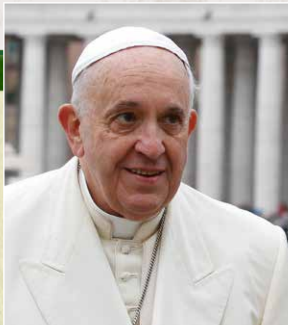
Pope Francis arrives to lead his general audience in St. Peter's Square at the Vatican September 24.

... Of course, all of us are called to mature in our work as evangelizers. We want to have better training, a deepening love and a clearer witness to the Gospel. In this sense, we ought to let others be constantly evangelizing us. But this does not mean that we should postpone the evangelizing mission; rather, each of us should find ways to communicate Jesus wherever we are. All of us are called to offer others an explicit witness to the saving love of the Lord, who despite our imperfections offers us his closeness, his word and his strength, and gives meaning to our lives. In your heart you