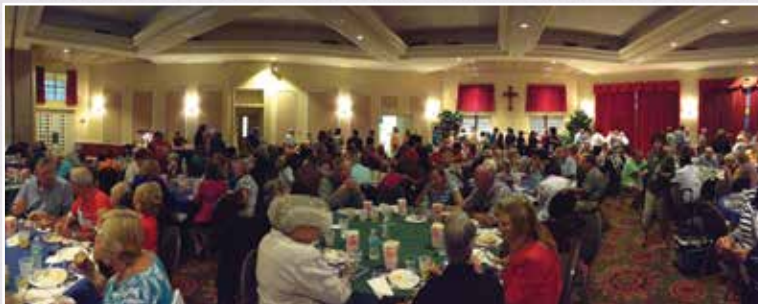
Super Bowl 2014