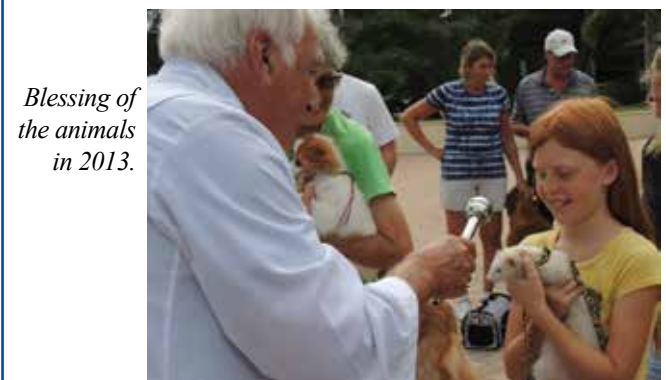
Blessing of the animals in 2013.