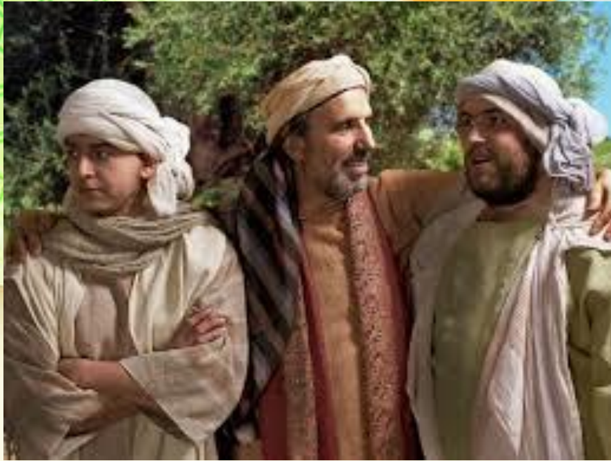
The Two Sons and the Vineyard