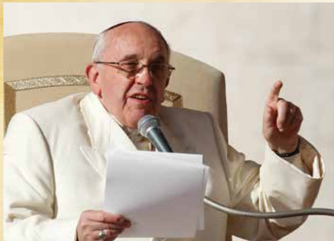
Image: Pope Francis delivers his talk during his general audience in St. Peter's Square at the Vatican December 4.

The Season of Advent is... "a new journey of the People of God with Jesus Christ, our Shepherd, who guides us through history toward the fulfillment of the Kingdom of God. Therefore, this Season has a special charm, it makes us experience deeply the meaning of history. We rediscover the beauty of all being on a journey: the Church, with her vocation and mission, and all humanity, peoples, civilizations, cultures, all on a journey across the paths of time.