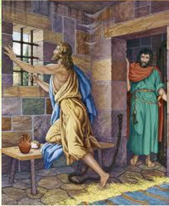
John the Baptist in Prison