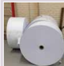
Scott Schlossberg at Messner Publications with the new 100 foot long million dollar press and the roll of paper used to print our weekly bulletin.