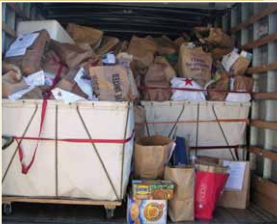
At the November St. Vincent de Paul food drive, St. John parishioners donated essential food items to fill a 1 ½ ton truck from floor to ceiling, roughly $50,000 worth of food, to help out those in need.

God's poor in countries that are devastated by famine, rebellion and oppressive governments. People are challenged in many ways to extend their love in the areas of society where love is yet to be born!