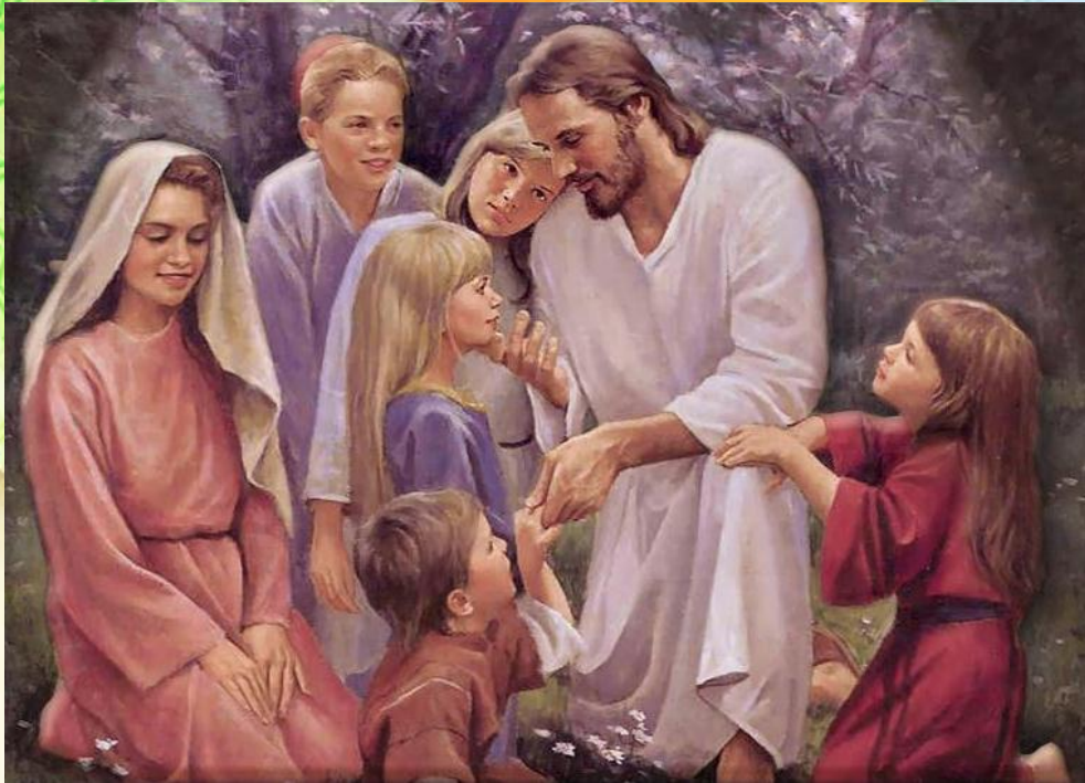
Love one another