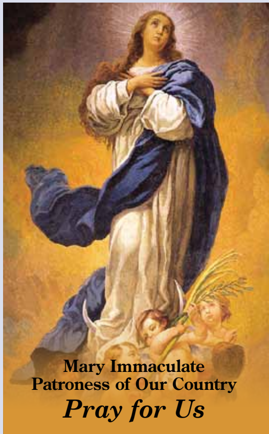
Mary Immaculate Patroness of Our Country Pray for Us

Grant, we pray, O heavenly Father, a clear and united voice to all your sons and daughters gathered in your Church in this decisive hour in the history of our nation, so that, with every trial withstood and every danger overcome — for the sake of our children, our grandchildren, and all who come after us — this great land will always be “one nation, under God, indivisible, with liberty and justice for all.” We ask this through Christ our Lord. Amen.