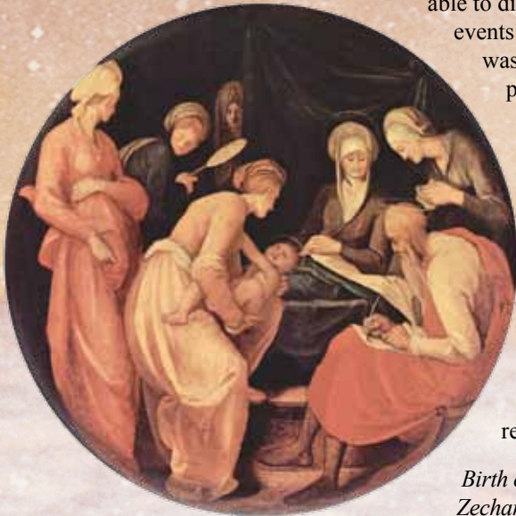
Birth of St. John the Baptist, depicting Zechariah writing, "His name is John".

able to discern His presence through people and the events that unfold in our lives. John the Baptist was set apart to specifically make God's presence known in the world. John had to discern his purpose through prayer. The Baptist's response to his prayer and in answering the call was to put his faith into action. Likewise, we too, must discern through prayer what God is calling each one of us to do and put our faith into action. John the Baptist revealed God's plan through his witnessing to the obligation or repentance and leading a moral life. We are also called to that same position within our own faith life in response to live out our baptismal promises.