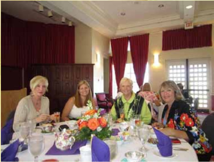
Catechist appreciation tea

Faith Formation... had an appreciation tea for our catechists in the library on Sunday, April 22, 2012. Catechists are volunteers who give several hundred hours of their time each year teaching children the Catholic faith. The children are the future of the Church.