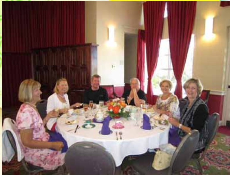
Catechist appreciation tea