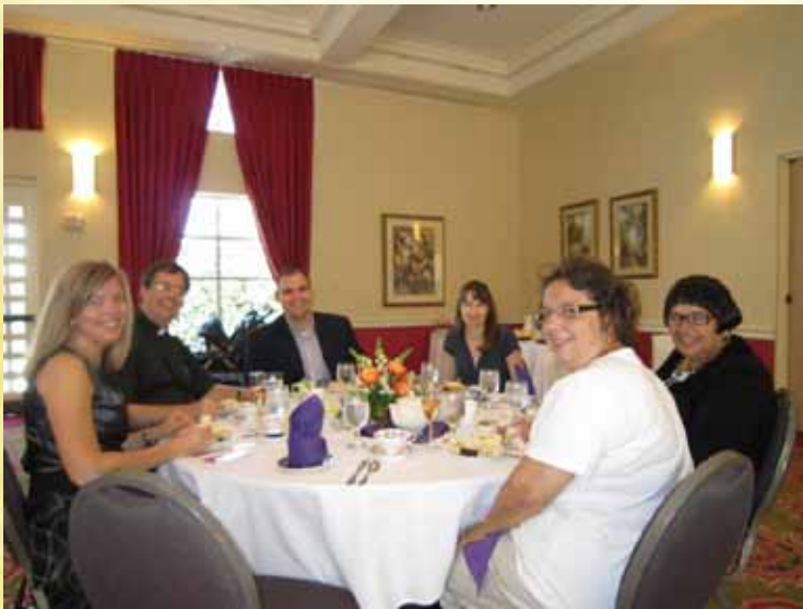
Catechist appreciation tea