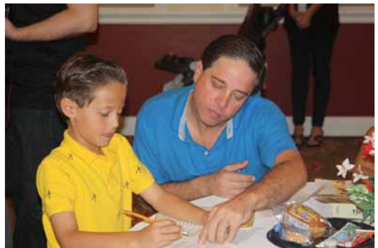
Father and son studying together.

Faith Formation Office 625 111 th Ave. North Naples, FL 34108-1825 Phone: 239-514-2927 ext. 124 Fax: 239-566-9117