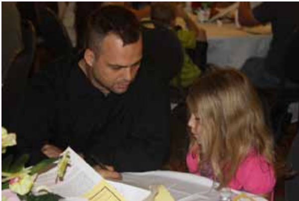
Father studying with his daughter.

First Reconciliation Ceremony... will take place on Thursday, December 15, 2011 at 5:30 p.m. in the church. Through the celebration of the Sacrament of Reconciliation children learn to know Jesus as their Friend, to love Him above all things, to love others, and to have contrition for their sins when they fail to love.