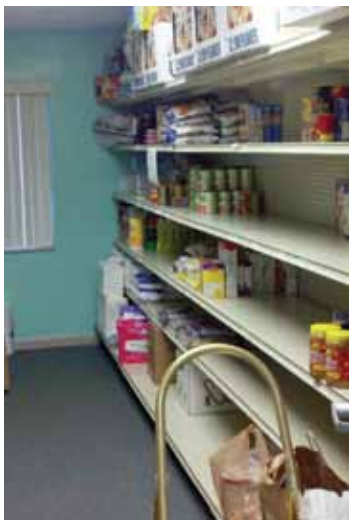
Pantry on November 20