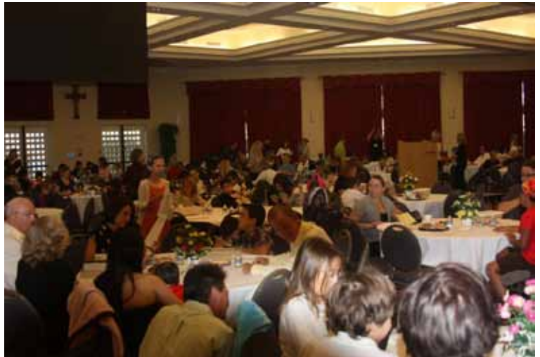
"Families in Christ" is well attended.