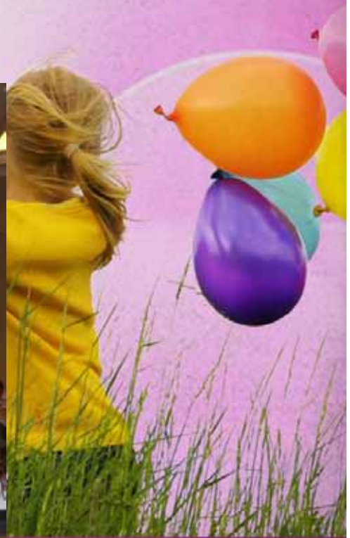
“Families in Christ” on November 13, 2011