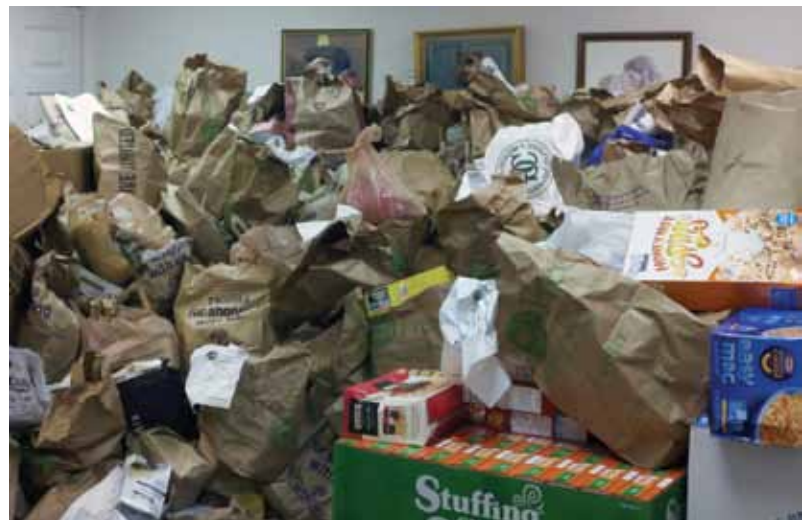
The St. Vincent de Paul truck arrives after the Thanksgiving Food Drive