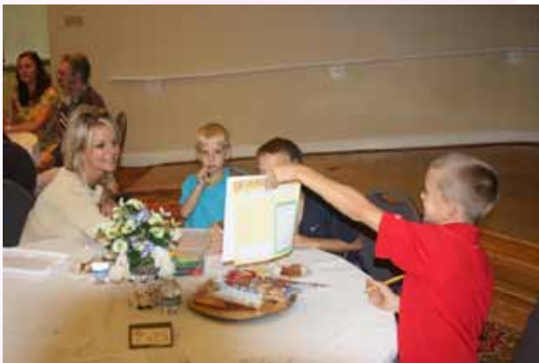
Mother studying with her children.