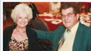
Approximately 220 were in attendance to honor the seminarians who are committed to serve as priests in the Diocese of Venice and to say thank you to the priests already serving in the diocese.