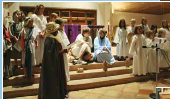
"Away in a Manger"