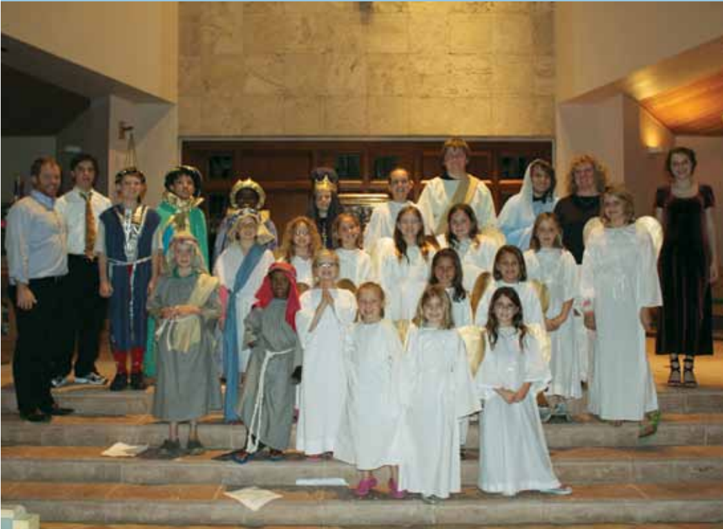
The Cast and Directors of One Starry Night in Bethlehem

Families got a taste of life in the Holy Land right here at St. John the Evangelist Friday, December 16. At the Marketplace they baked some bread, made a crown in Herod's Palace, or created other fun crafts. Because the hungry travelers came from afar, they shared a covered dish, while the Marketplace provided turkey and drinks for all. After eating and walking through town, they travelled to the church to witness the Journey to the Manger firsthand in a Christmas Concert told in story and song by the combined St. John the Evangelist choirs (Adult, Children and Contemporary) and several talented soloists. After the concert, the travelers gathered for a birthday celebration for Jesus with cake and goodie bags, and, of course, a visit from Santa.