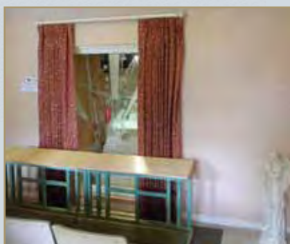
FEATURES OF NEW ADORATION CHAPEL